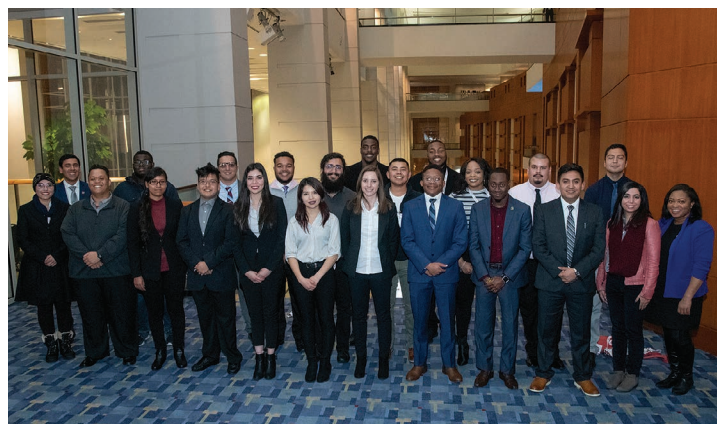
2019 Transportation Research Board Minority Student Fellows Cohort.

Find the full table of awards here: http://bit.ly/2WR0oSX