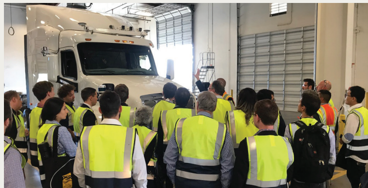
PSR Congress attendees receive a tour of the TuSimple facilities in Tucson, Arizona.