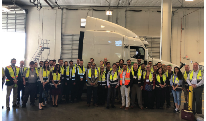
The PSR group at TuSimple METRANS at TRB 2019: METRANS Research.